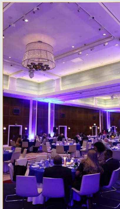
"Celebratory Gala Dinner hosted at the Museum of the Future, Dubai, in the presence of decision makers controlling assets in excess of USD 2 Trillion"