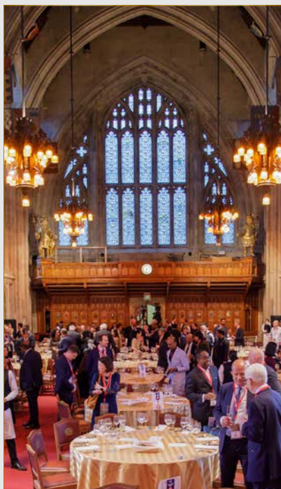
"Celebratory Gala Dinner hosted at the House of Commons, London, United Kingdom, in the presence of decision makers controlling assets in excess of USD 6 Trillion"