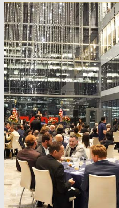
"Celebratory Gala Dinner hosted at the The Star, One Cowboys Way, Dallas in the presence of decision makers controlling assets in excess of USD 11 Trillion."