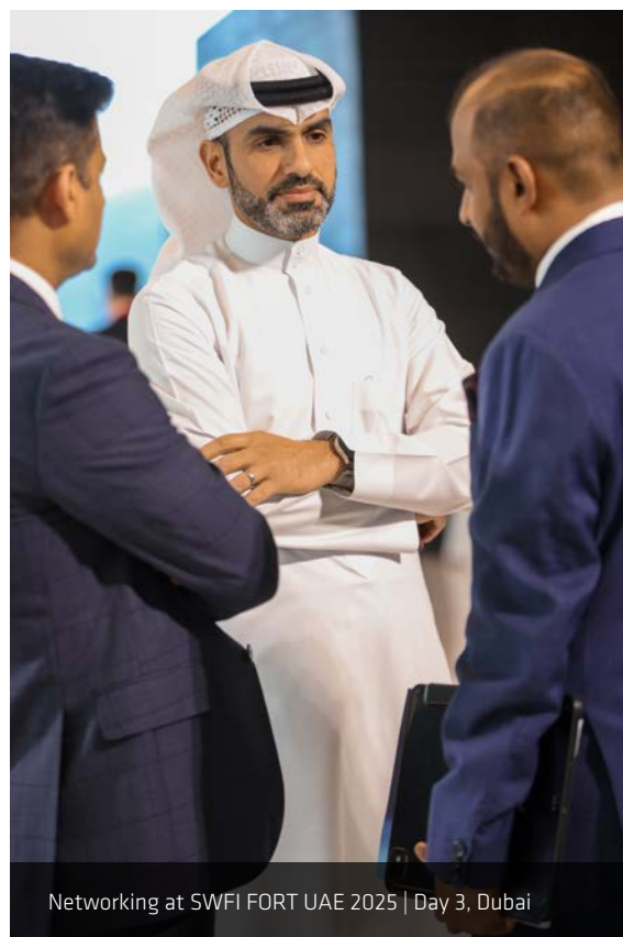
Networking at SWFI FORT UAE 2025 | Day 3, Dubai