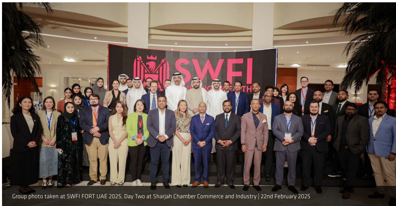
Group photo taken at SWFI FORT UAE 2025, Day Two at Sharjah Chamber Commerce and Industry | 22nd February 2025