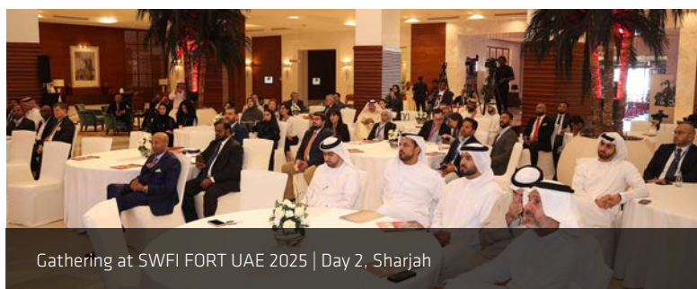
Gathering at SWFI FORT UAE 2025 | Day 2, Sharjah